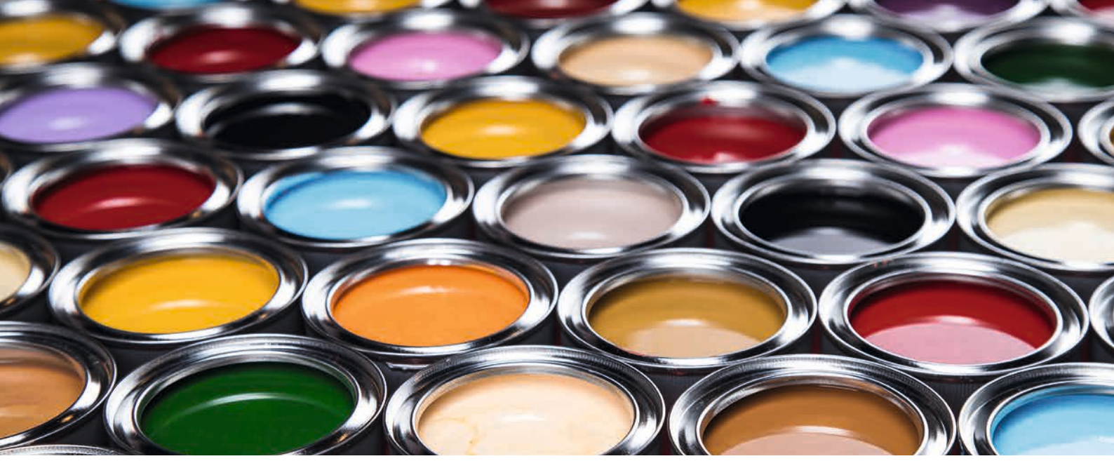
Omya identified the right mixture of salts to stabilize water-based products, e.g. paints.